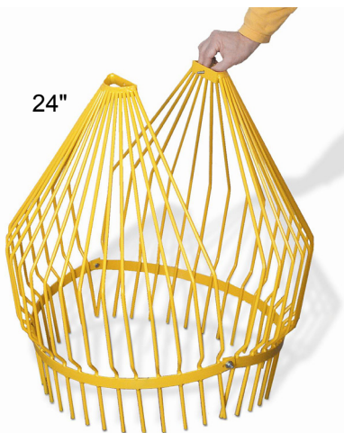
24" - 30" Bar Guards are in two pieces. (Bolts, washers, and nuts are included.)

*Special-sized Bar Guards to fit 12" Hickenbottom Intakes and 15" pipe.