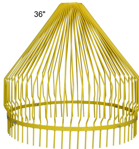
36", 42", and 48" are in four pieces. (Bolts, washers, and nuts are included.)