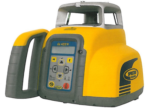
GL412N/GL422N features a strong metal sunshade