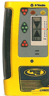
CR600 Combination Receiver can be machine or rod mounted for increased productivity applications