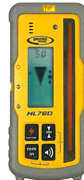
HL760 Digital Readout Receiver to measure and display beam location