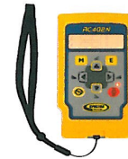
RC402N Radio Remote Control for all applications